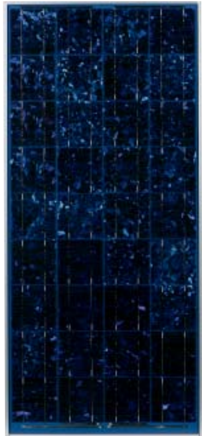
BP SX 60