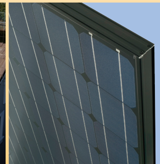
Laminated glass construction in a high torsion frame.