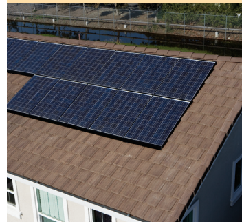
Black frame improves aesthetics for residential roof top applications.

This module uses an advanced solar cell surface texturing process to increase light absorption and improve efficiency.