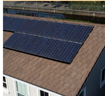
Black frame improves aesthetics for residential roof top applications.

This module uses an advanced solar cell surface texturing process to increase light absorption and improve efficiency.