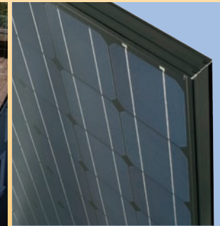
Laminated glass construction in a high torsion frame.