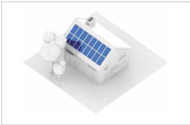
Partial shading: One MPP tracker per module ensures optimal energy production, even with dynamic shading.