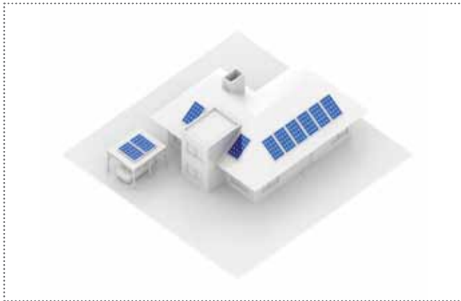
Optimal use of roof surface: Complex roof configurations can be used to maximize system output without impacting the rest of the system.