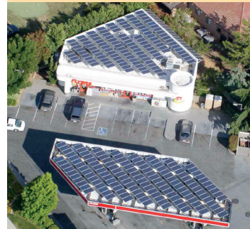
Sharp multi-purpose modules offer industry-leading performance for a variety of applications.

This module uses an advanced surface texturing process to increase light absorption and improve efficiency.