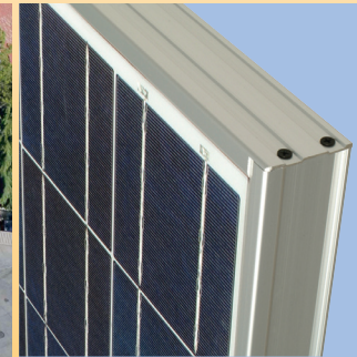
Improved Frame Technology