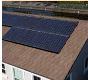
Black frame improves aesthetics for residential roof top applications.

This module uses an advanced solar cell surface texturing process to increase light absorption and improve efficiency.